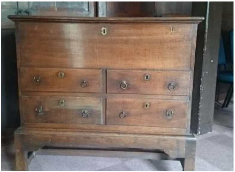
Figure 3: Cabinet in reception area dated 1794.

The reception area contains an oak document cabinet (Fig.3) with a large single top drawer and two pairs of drawers below with brass fittings. The cabinet contains a message: "this box was made by John Rullson of April in the year 1794 for the soul use of the Monthly Meeting of Great Strickland to preserve securely all the deed writings and other papers belonging to the said meeting and paid for at the public expense."