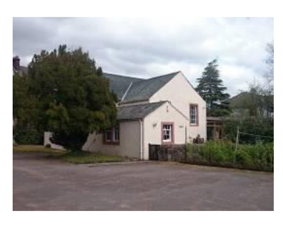
Statement of Significance

The meeting house at Penrith has high heritage significance as a late seventeenth-century building used as the first dissenting place of worship in Penrith. The meeting room retains original furnishings dating from 1803.