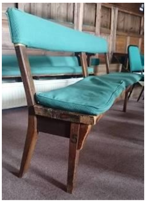
Figure 2: Historic pine bench

The seating consists of a mixture of historic benches and modern loose chairs arranged in a circle around a central table. The main meeting room contains historic pine benches (Fig.2) possibly dating from 1803 or earlier, with later upholstery.